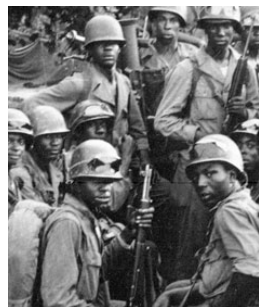
For Love of Liberty: The Story of America's Black Patriots